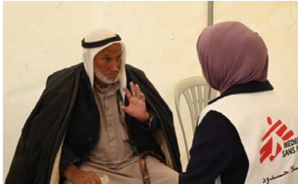
An MSF staff member speaks to a 70-year-old beneficiary from Al-Majaz community in Masafer Yatta, West Bank, Occupied Palestinian Territories.

The first month after 7 October was especially violent, which was reflected in the increase in mental health support needed. Up to 149 Palestinians who had experienced violence by Israeli soldiers and/or settlers required psychological first aid from MSF—compared to 78 during the previous month, a 91% increase. As of 7 March 2024, MSF’s mental health team in Hebron has provided counselling and psychotherapy sessions to 125 new survivors of violence by Israeli forces and/or settlers since 7 October, including 54 women and 40 children, some as young as three, four, and five years old. An additional 321 Palestinians (including 29 children and 158 women) who were affected by violence by Israeli forces and/or settlers received psychological first aid from MSF. Of those, 292 were affected by violence by the Israeli forces (91%), 10 by Israeli settlers (3%), and 19 by Israeli forces and settlers (6%). The vast majority, 226 patients, exhibited symptoms of anxiety after experiencing a home incursion.