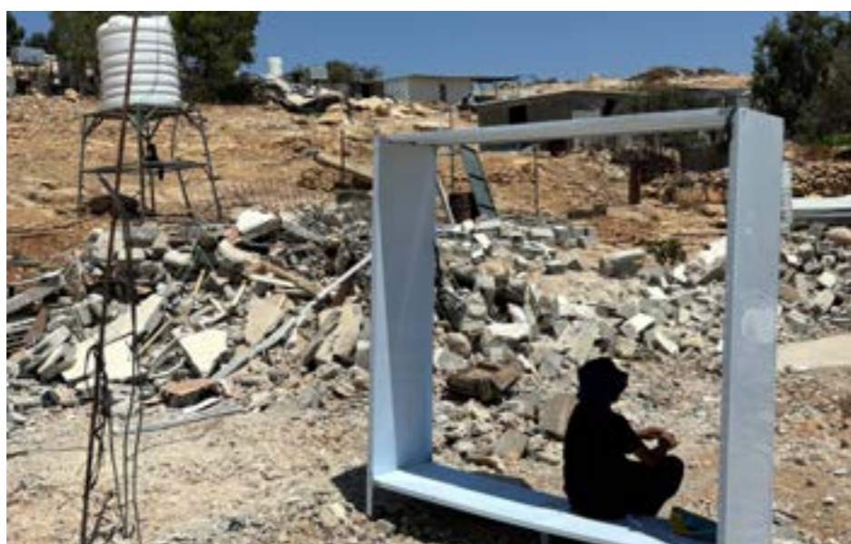
Palestinian teenager finding shelter from the sun after his home was suddenly demolished without warning in Umm al Kheir, Masafer Yatta, West Bank, Occupied Palestinian Territories.

In situations of occupation, both IHL and international human rights law (IHRL) apply. Under a human rights framework, freedom of movement may only be restricted in exceptional circumstances to protect national security, public order, public health or morals and the rights and freedoms of others (Article 12(3) of the International Covenant on Civil and Political Rights). However, restrictions on freedom of movement must be strictly necessary, proportionate and be the least intrusive measure possible to achieve the desired result. 33