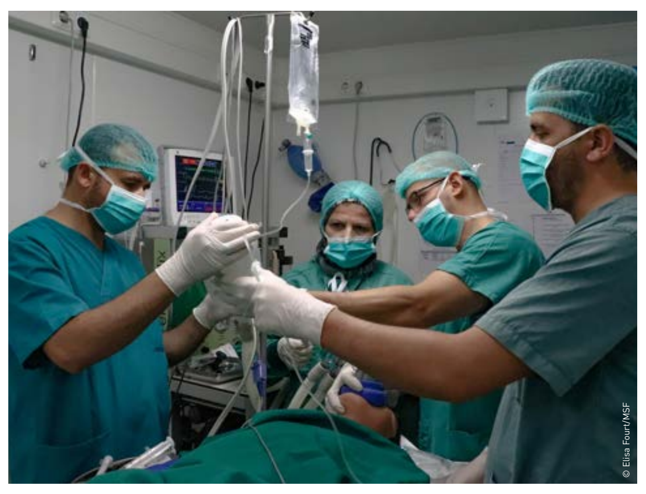
Doctors put a patient under anaesthesia before a surgery begins at MSF's comprehensive post-operative care facility in East Mosul.