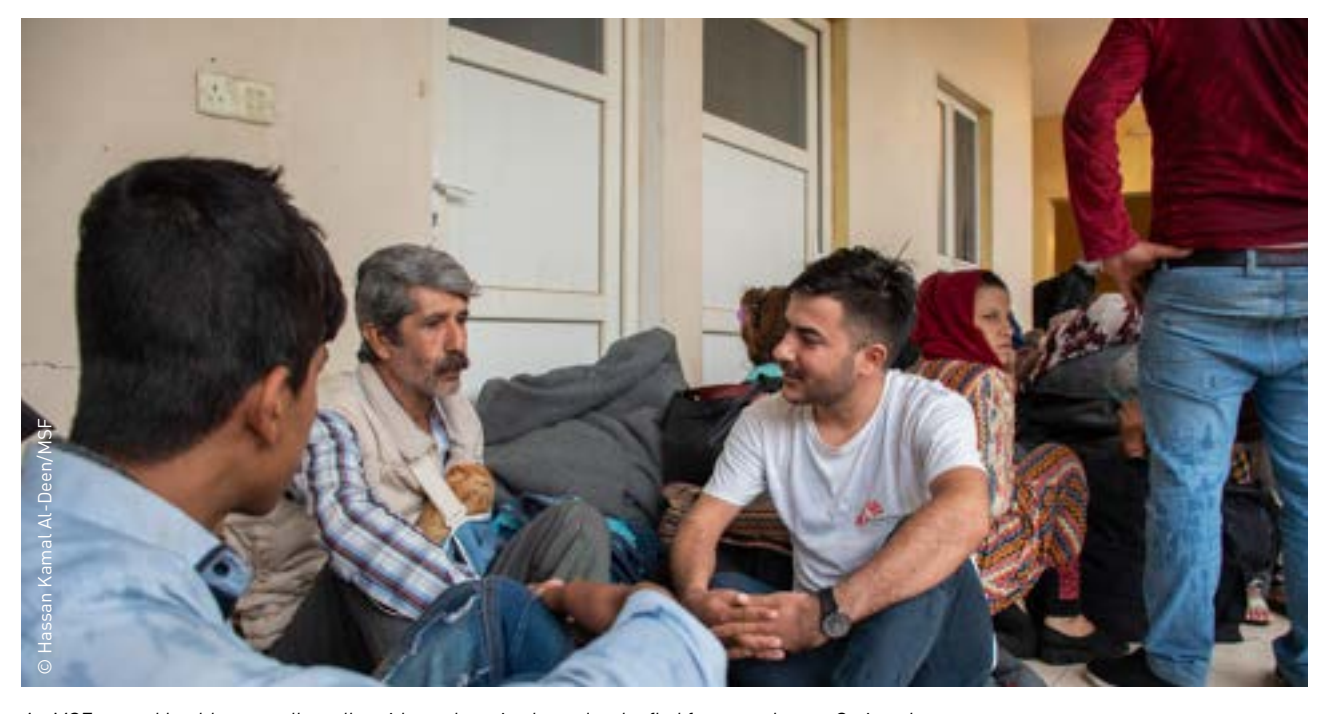
An \ MSF \ mental \ health \ counsellor \ talks \ with \ newly \ arrived \ people \ who \ fled \ from \ north-east \ Syria \ to \ Iraq.