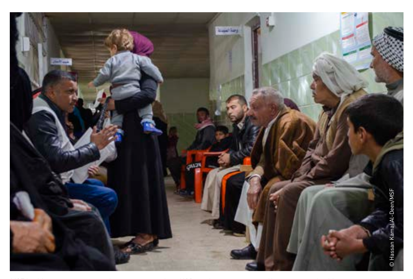
MSF health promoter runs an education session about NCDs in the waiting room at Hawija primary healthcare centre, supported by MSF.