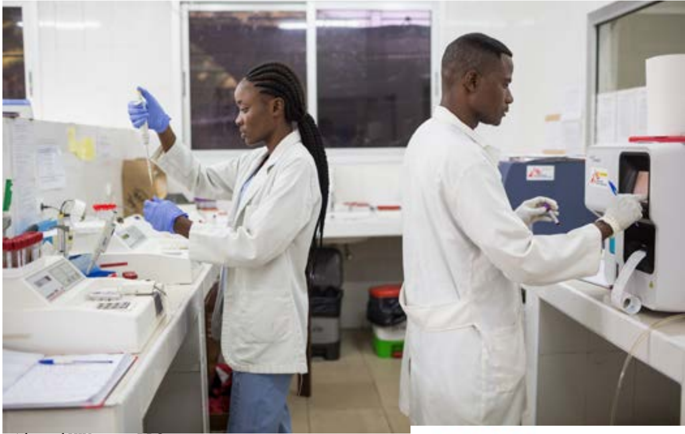
Advanced HIV project. DRC, 2017.