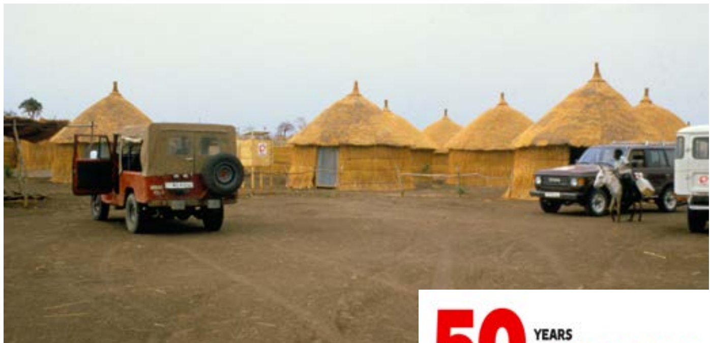
Refugee camp, Ethiopia, 1985.