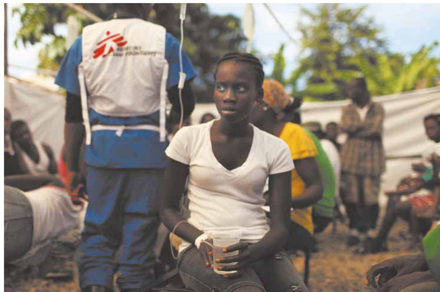
A woman recovers from cholera in a hospital compound in St Marc, Haiti, in November 2010. Cholera patients need to replace lost fluids by drinking lots of oral rehydration solution or receiving fluids intravenously.; Bottom: Javid outside the MSF hospital in Cité-Soleil.