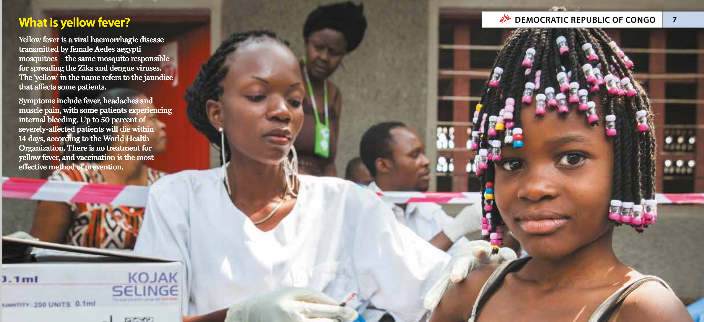
A girl waits calmly for her shot in the arm, administered by a local nurse, in the courtyard of a primary school in Kinshasa on the first day of the vaccination campaign.

Symptoms include fever, headaches and muscle pain, with some patients experiencing internal bleeding. Up to 50 percent of severely-affected patients will die within 14 days, according to the World Health Organization. There is no treatment for yellow fever, and vaccination is the most effective method of prevention.