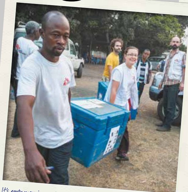
It's early morning on day one of the campaign, and an MSF team at base camp unloads the vaccines, which are stored in cool boxes.