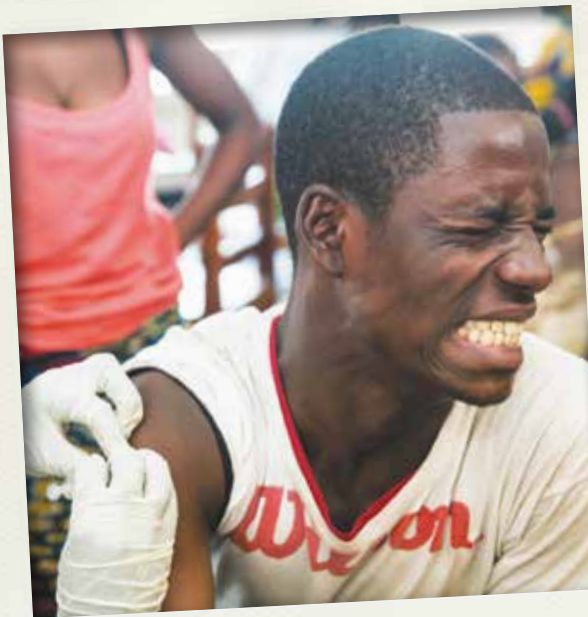
A young man screws up his face as the nurse pushes the syringe home.