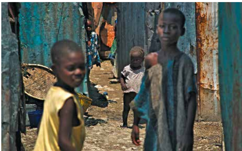
Children play in the streets of Cité-Soleil.

I remembered: he was young. I watched his eyes cloud over as he stopped breathing. He continued to struggle and looked straight into my eyes. We didn't stop. We tried every treatment available: adrenaline, aminophylline, magnesium and salbutamol. We carried out CPR for what seemed an age, through three arrests and three returns. I reflected afterwards that I'd forgotten ketamine, but we would never have intubated him anyway, since there were no ventilators and no blood