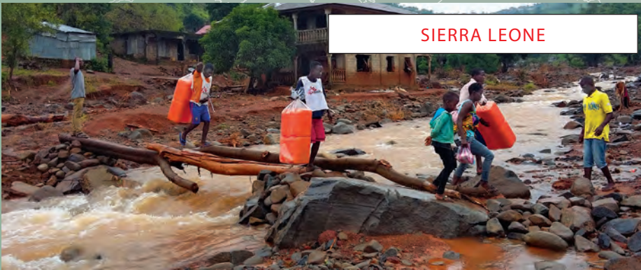
On 14 August, a mudslide on the outskirts of Sierra Leone's capital, Freetown, left 500 people dead, 600 missing and 3,000 homeless. Further flooding cut off communities, leaving them without access to clean drinking water. On 22 and 23 August, MSF teams crossed rivers to reach the community of Jah Kingdom with clean water and essential supplies for its 1,000 residents.