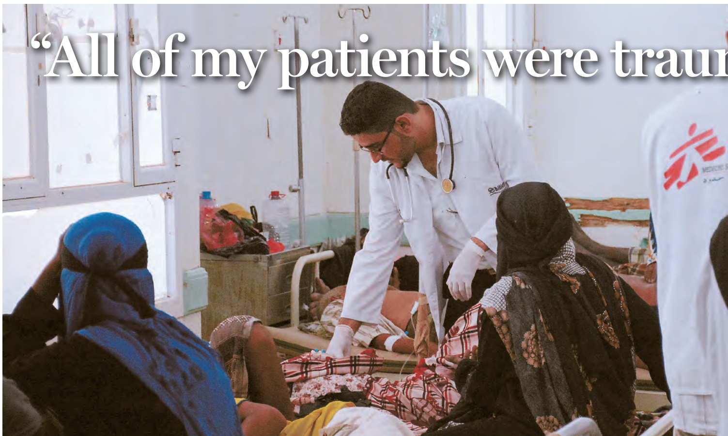
MSF medics treat cholera patients in Aden. As cholera spread across the country, MSF logisticians renovated an abandoned building next to the surgical trauma hospital.