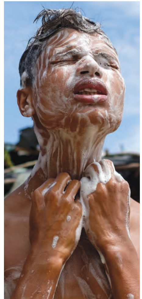
A boy washes in the open in Kutupalong makeshift camp.

We need 8,000 latrines built – that's a ratio of one latrine to 50 people. The longer the delay, the greater the risk of an outbreak of a waterborne disease. We need to supply two million litres of water per day just to provide five litres of water per person per day in one camp. We need huge amounts of food and emergency relief supplies to