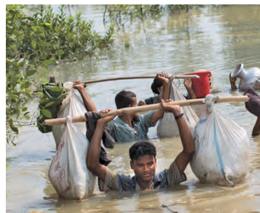
A Rohingya family reaches Bangladesh after crossing a river in Myanmar.

“Our teams in Bangladesh are hearing alarming stories of severe violence against civilians in northern Rakhine,” says Kleijer. “Villages and houses have been burned down, including at least two out of four MSF clinics. We fear that those remaining there are unable to access the help they may need. MSF and other international aid agencies must be allowed immediate and unhindered access to all areas of Rakhine State. Without this, there is a very real risk that people will die unnecessarily.”