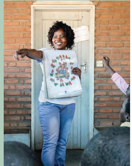
An MSF team member spreads the word about HIV in Malawi.