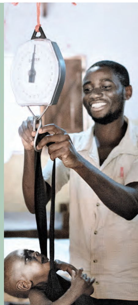
A small child is weighed at a therapeutic feeding centre in Tanzania.

The prototype IV bag holder was developed and successfully lab-tested. The team will now take this further and test it in the field, after which the designs can be finalised and a final product can be fitted inside every MSF Land Cruiser that needs it.