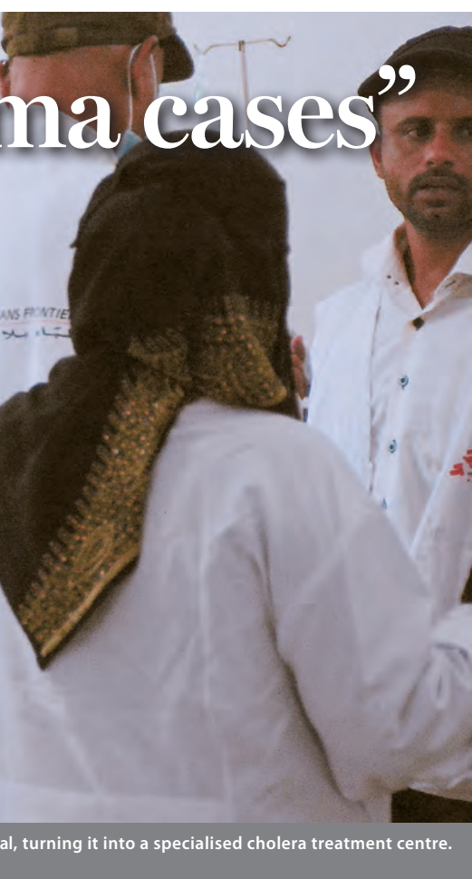
al, turning it into a specialised cholera treatment centre.

injuries so we had to feed her via a drip. But by the time I left, her wound was improving and her nutritional state was good. I'm hopeful that she'll do well. She certainly wouldn't have survived without the ICU.