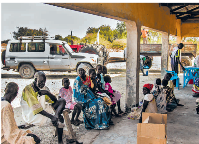
Left: People wait patiently to see a doctor at a mobile clinic in a remote area of South Sudan.