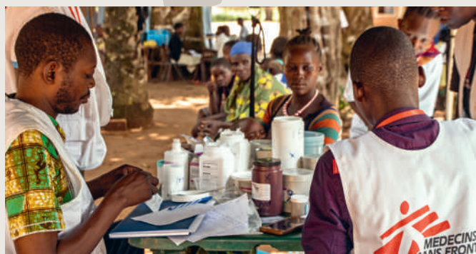
An MSF mobile medical team see patients in Yambio.

In South Sudan's Yambio county, MSF is providing help for demobilised child soldiers.