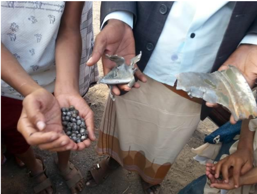
Shrapnel of the airstrike, according to local residents.