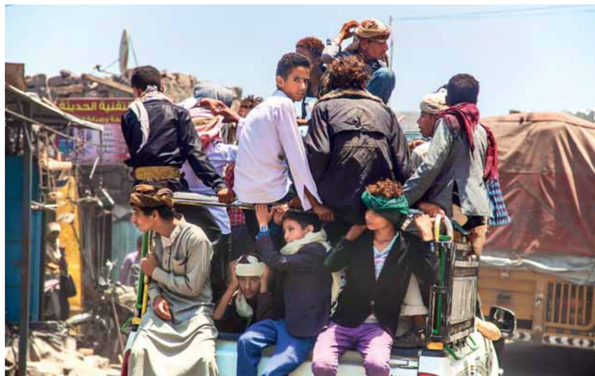
A group of boys ride on a vehicle in Hodeidah. Illustration © Isabella Sutton

The conflict in Yemen has now entered its sixth year.